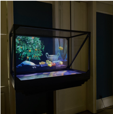
Installation View (detail) Credit: © David Cotterrell (2022)

The work is part of a series of studies produced through a sustained engagement with Mexico during the global pandemic and is a component of a wider ongoing concern with post-colonial debates, identities and awareness.