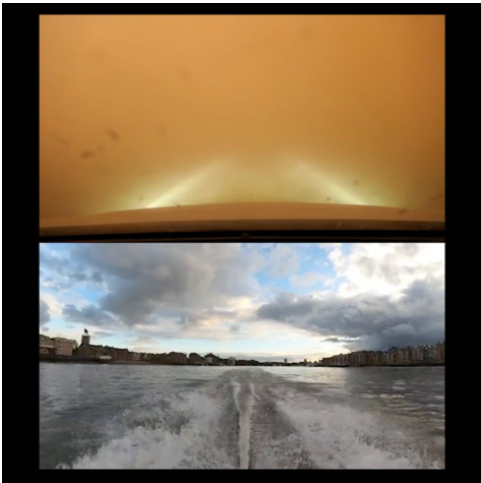
Still from 'A Yard for Your Thoughts' Credit: © Big Bend Film Collective (Cotterrell & Valentine) (2021)