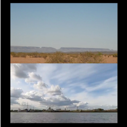
Still from 'A Yard for Your Thoughts' Credit: © Big Bend Film Collective (Cotterrell & Valentine) (2021)