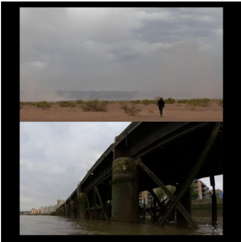
Still from 'A Yard for Your Thoughts' Credit: © Big Bend Film Collective (Cotterrell & Valentine) (2021)