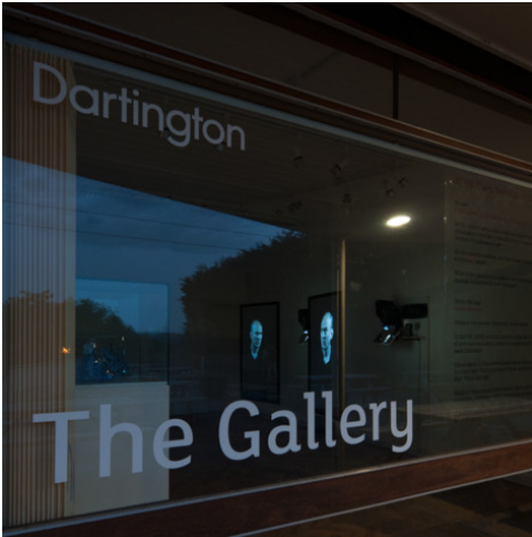
Dartington Gallery (2015)