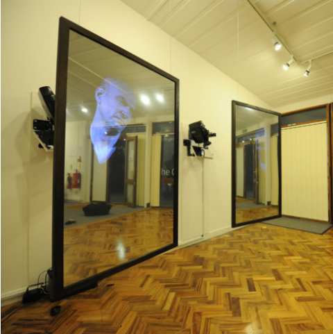
Mirror I Credit: © David Cotterrell (2015)