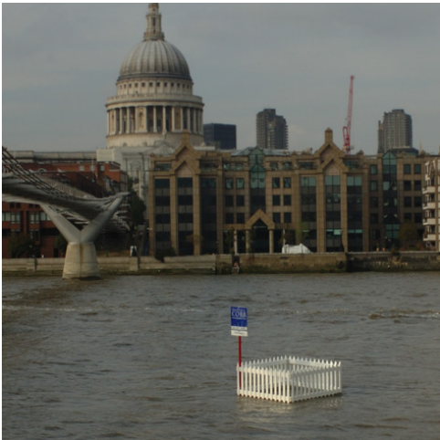
The postcard view