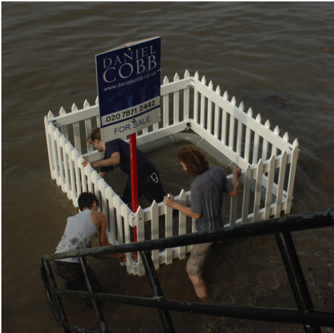
Running out of time