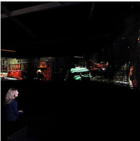
Installation at Wellcome Collection, London

Theatre is a simulation of a simulation: a reconstruction of the last day of training for medical evacuation crews before they are deployed to Afghanistan or Iraq. It offers a rare glimpse of what is hidden from the public eye.