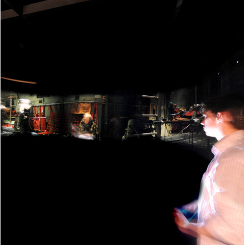
Installation at Wellcome Collection, London