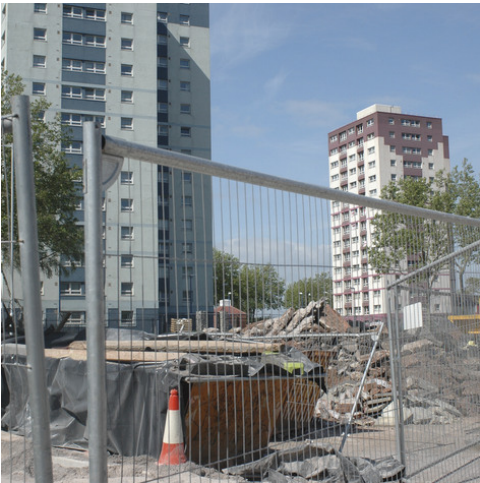
Transitional landscape Credit: David Cotterrell (2005)