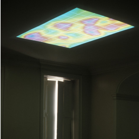
Installation at Danielle Arnaud contemporary art