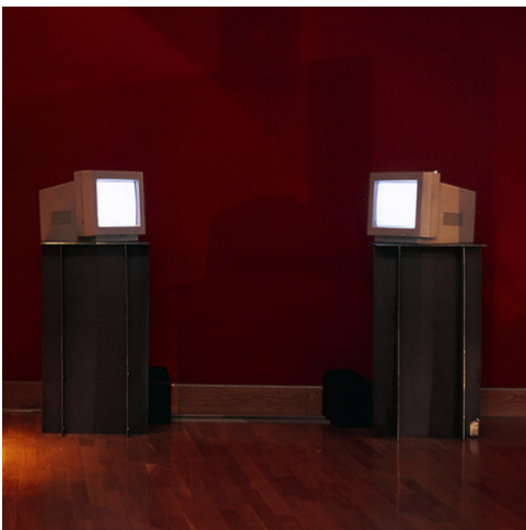
Installation at the Lighthouse Gallery Credit: David Cotterrell (2001)

TDS is a computer installation using software which was developed for ELIZA, a self generating speech programme that responds to the users input. ELIZA is programmed according to a rhetorical logic tree that responds to a users keywords in order to generate an appropriate response. The programme has its limitations: it is purely responsive and cannot develop an inner logic of its own. Instead of creating a user/computer set up, Cotterrell chose to generate a Rogerian conversation between two computers. The work was made and exhibited in 2001, with Cotterrell reworking the original ELIZA code to create a more subversive use of the programme. TDS reflects on ELIZAs artifice: able to dispense the belief that one is in conversation with an intelligent being, the illusion is quickly broken down to reveal the flaws in its script. By replacing the human user with a computer, a double rhetoric was created in which both machines attempted to analyse and question each other, which resulted in the complete breakdown of conversation in favour of mutual verbal abuse. The work is a precursor to The Debating Society