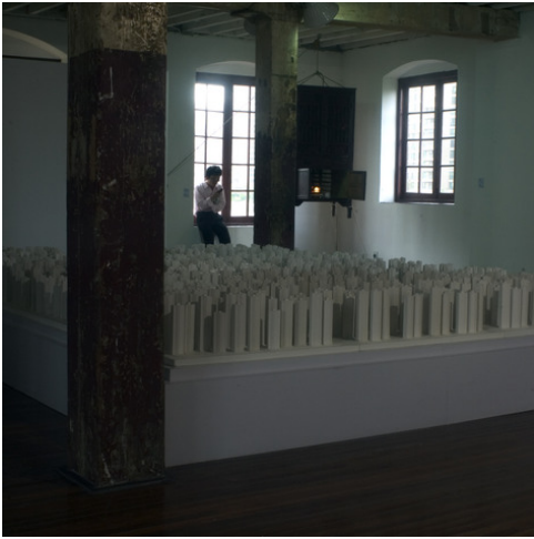
Installation in Shanghai

Less Travelled is the concluding exhibition of the Artist Links China programme, a joint project between Arts Council England and the British Council. Artist Links sought to nurture a fragile cross-cultural environment between China and Britain through links between contemporary arts practitioners. As a development opportunity for artists, the programme facilitated early stage development of over 60 artists' projects in China and in England. Four artists who had contributed to the research residencies were selected to develop works for the Shanghai Biennale Off-Site exhibition, Less Travelled.