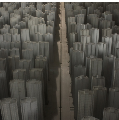
Dual Carriageway