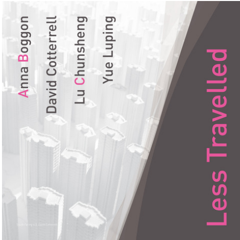
Exhibition Invite Credit: David Cotterrell