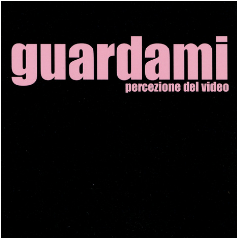
Exhibition Invite (2005)