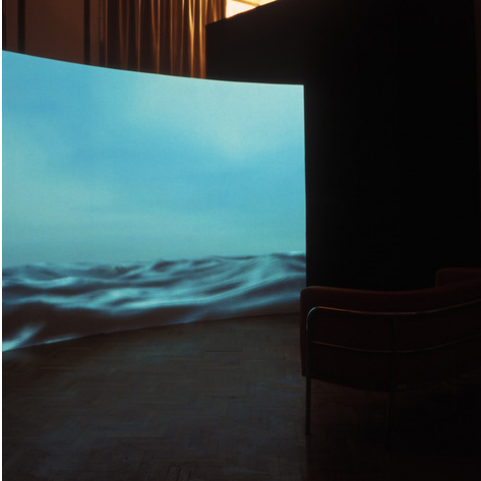
The parabolic installation in Siena Credit: David Cotterrell (2005)