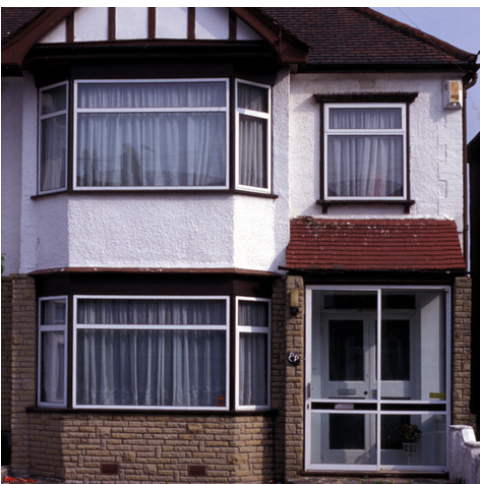
Class 'C' House 3 Credit: David Cotterrell (2002)