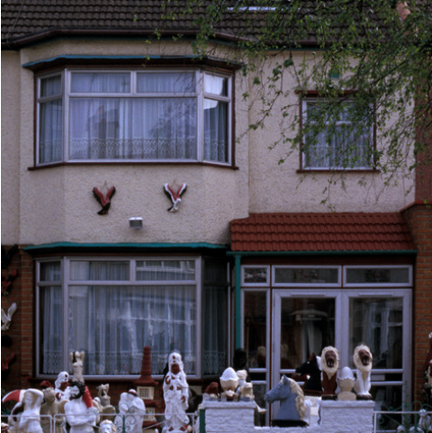
Class 'C' House 1 Credit: David Cotterrell (2002)