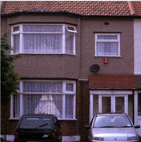
Class 'C' House 2 Credit: David Cotterrell (2002)