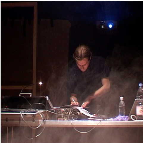
Programming the lighting controller (2002)