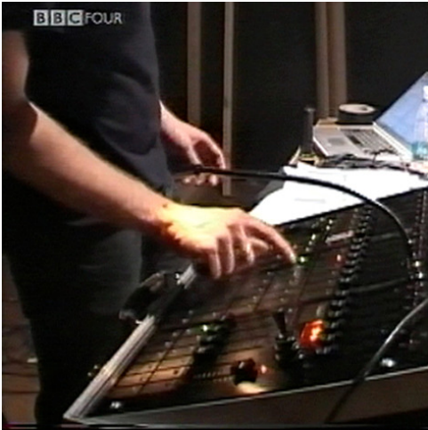
Programming the lighting controller (2002)