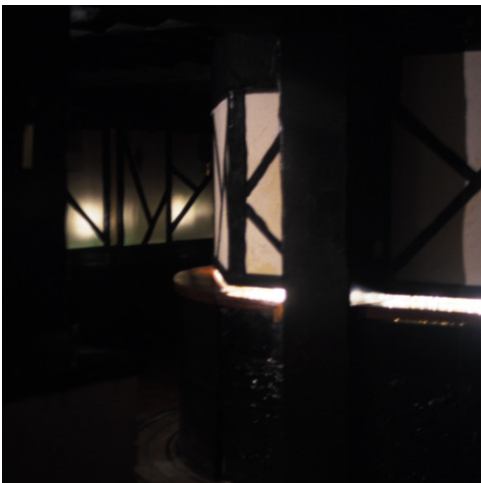
Filtered Light Credit: David Cotterrell (1997)