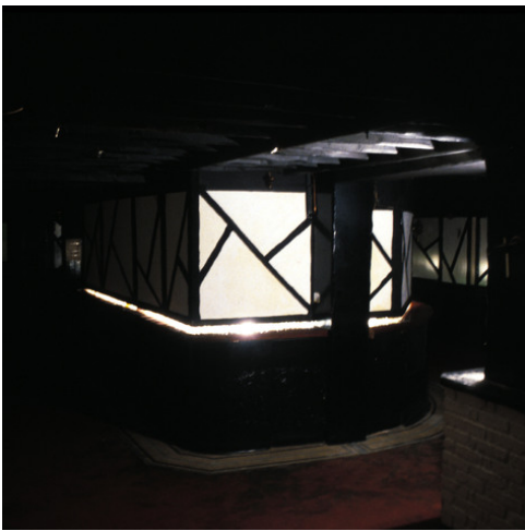
Completed Canopy Credit: David Cotterrell (1997)

Hidden Art of Hackney was a festival and series of exhibitions which offered artists access to disused and derelict sites within East London.