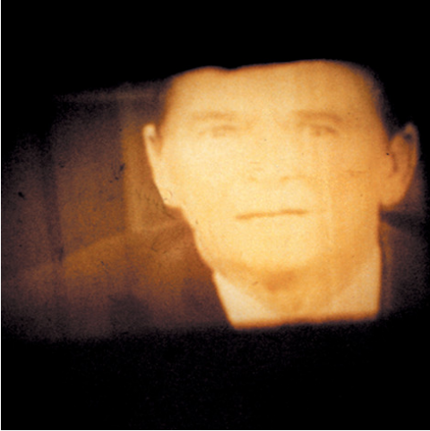
Super8 StarWars Explanation from R.Reagan (1996)