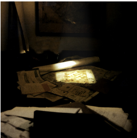
Super8 chess match