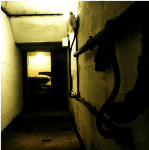
Entrance to Bunker