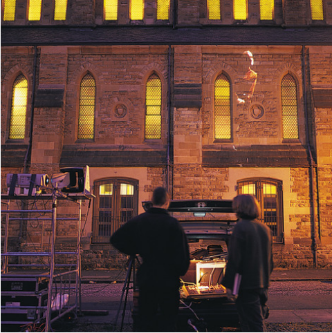
Control Centre (Back of Volvo 740) Credit: Dan Dubowitz (2001)