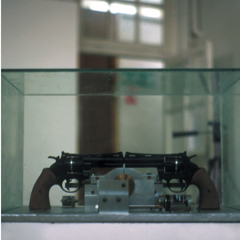
Protective Laminated Glass Case Credit: David Cotterrell (1999)