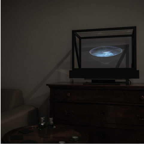
Wunderkammern - Envy Credit: © David Cotterrell (2024)