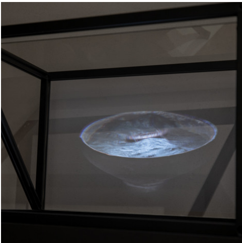
Wunderkammern - Envy (detail) Credit: © David Cotterrell (2023)

The artwork is one of a series of studies playing with reconstruction of impossible assemblages. The realisation of this work with the original artefacts, would be politically challenging and physically improbable. Using custom auto-stereoscopic screens, this latest experiment in holographic illusion imagined the illusionary construction of uncomfortable narratives and the virtual repatriation of contested artefacts.