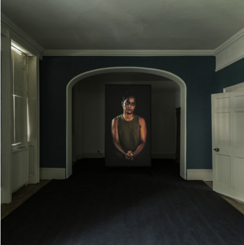
Mirror V installed at Danielle Arnaud gallery, London (2020)