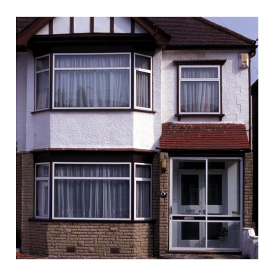
Class 'C' House 3 Credit: David Cotterrell (2002)