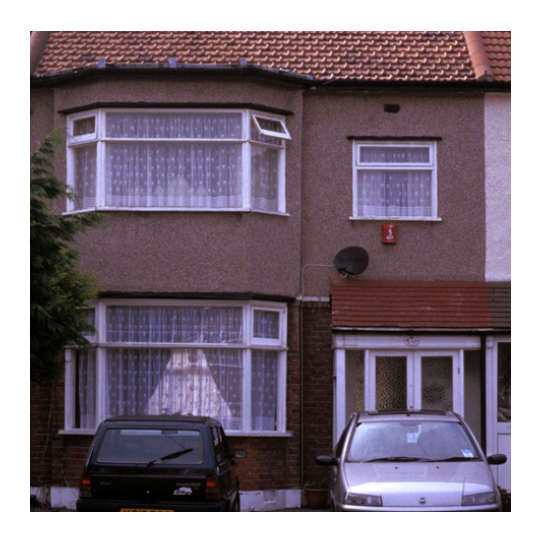
Class 'C' House 2 Credit: David Cotterrell (2002)