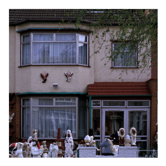
Class 'C' House 1 Credit: David Cotterrell (2002)