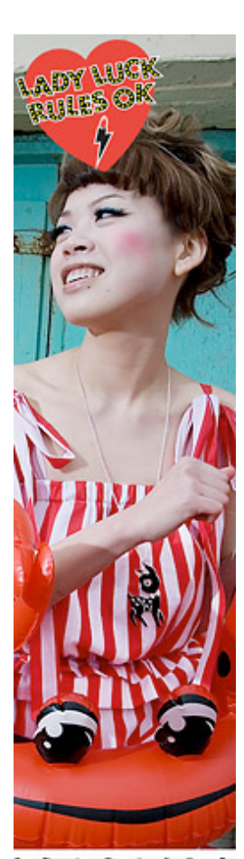
LADY LUCK RULES OK