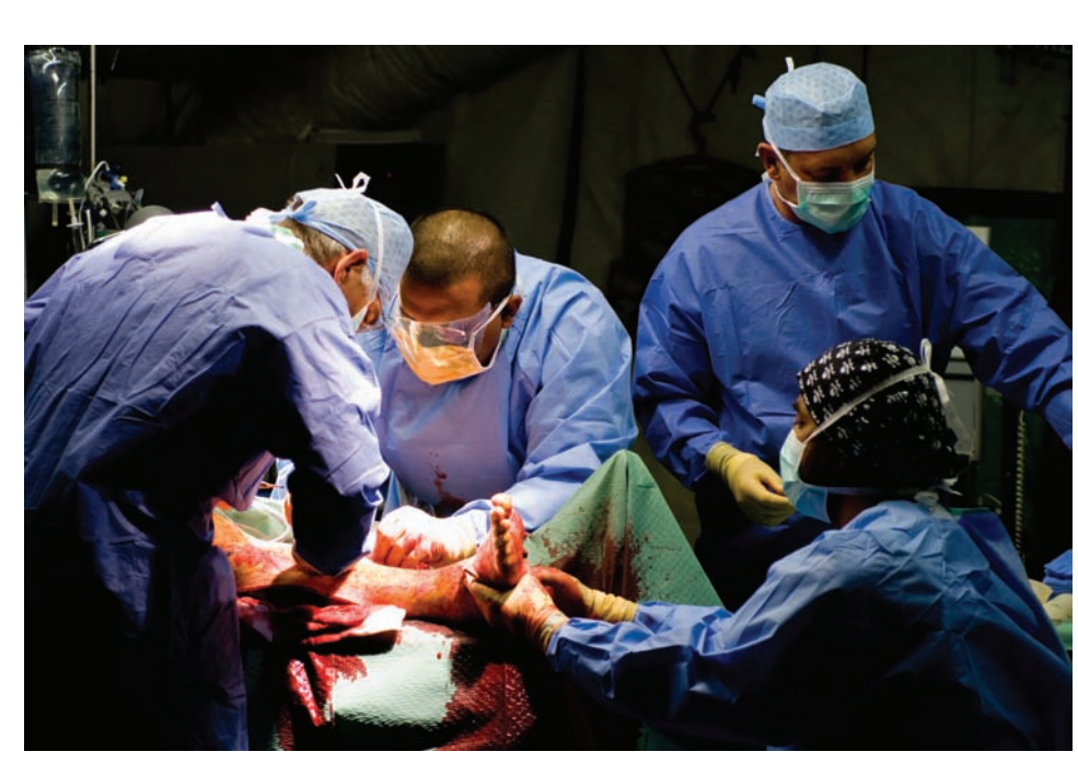
Principals 2008 triptych C-type prints

The most obvious injury is to his foot. Bone and flesh hang from its centre. The heel protrudes about two inches from the base of his sole. The x-ray explains. There are no fragments of shrapnel; the force of the blast has travelled through the armoured vehicle into his foot and with devastating effect has forced the bones from the base of the foot upwards. The neat lattice of bone and tendon has been rotated and pushed away from his heel. The anesthetist is beginning his work. The soldier keeps shouting "Sir" as he deliriously looks around